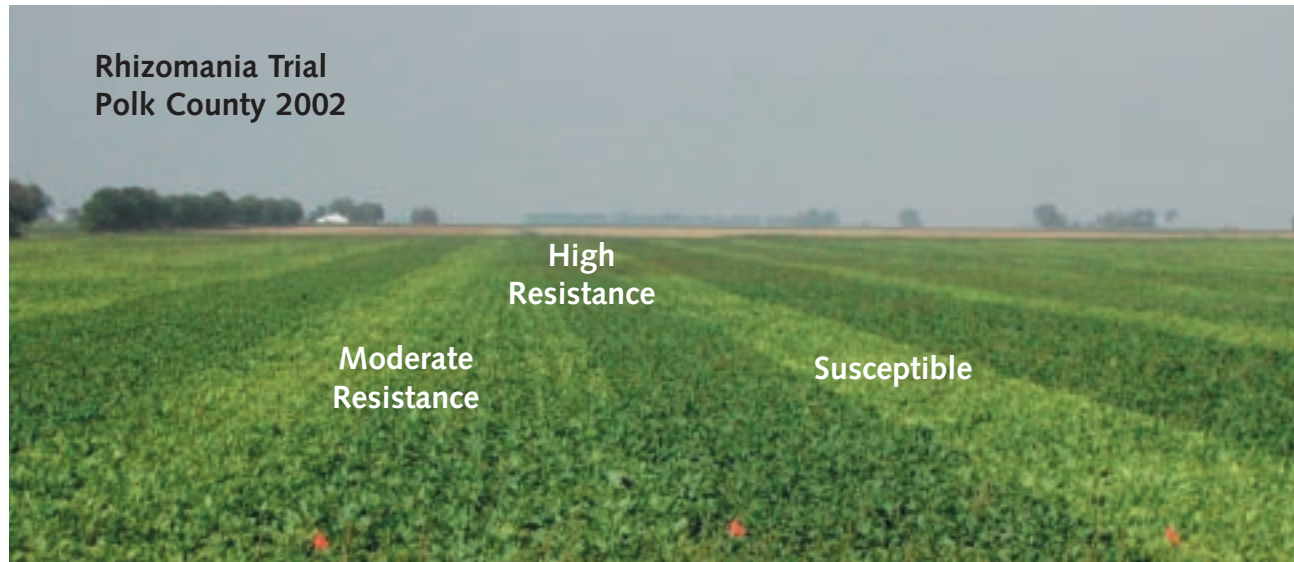
Figure 7. Polk County variety strip trial in 2002.