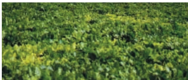
Figure 3. Foliar symptoms of rhizomania.

Typical rhizomania foliar symptoms can show up as early as mid-July and stretch out into late August and September. Foliar symptoms of rhizomania generally first occur in patches or in small areas of a field (Fig. 3). These patches have a fluorescent yellow leaf color. They often may be confused with nitrogen-deficient or water-stressed sugarbeets. These similarities, along with a tendency for rhizomania to occur in lower portions of fields with poor drainage, compound the difficulties in identifying the disease.