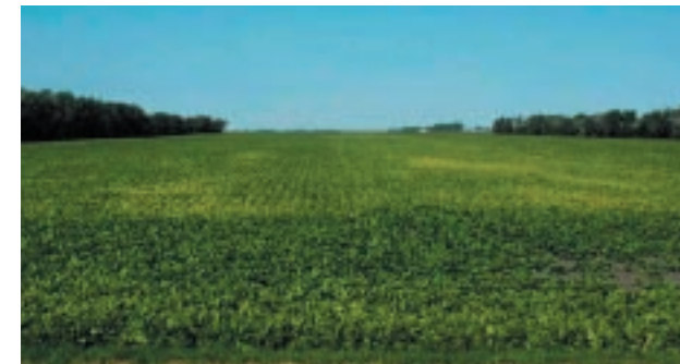
Figure 1. Rhizomania is easily detected by scouting fields in mid-August. Note the fluorescent yellow patches throughout the field—these areas can start out small and quickly infest whole fields in high-pressure areas.

Rhizomania attacks the plant's root and can severely reduce tonnage and sugar content, resulting in losses up to $300 an acre or more. It can survive and remain viable in the soil for at least 20 years.