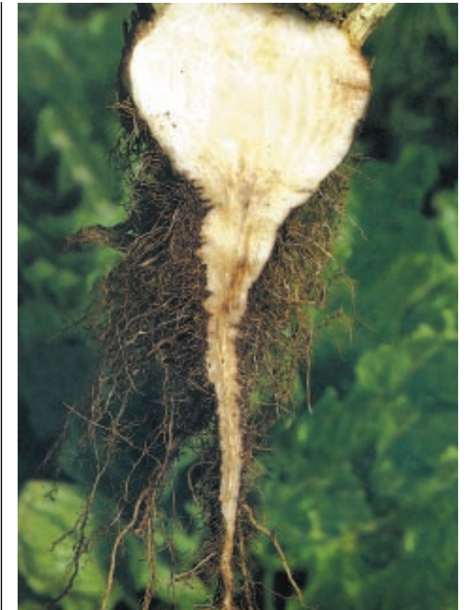
Figure 5. Bearded appearance of severely-infected roots.

Soil fumigation is another tool that has been used in other parts of the U.S. At this time, it's not clear that soil fumigation would be beneficial in the Red River Valley. The cost of fumigation may prohibit its use.