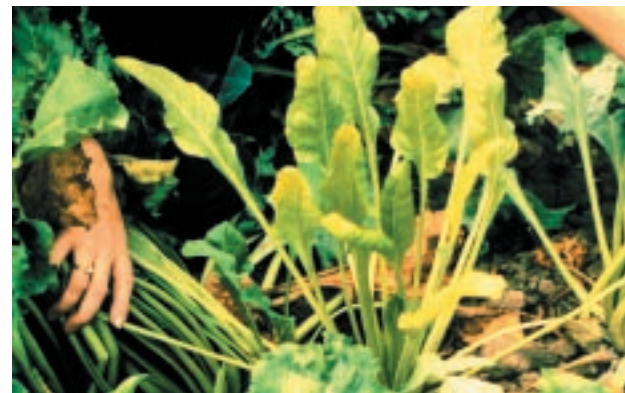
Figure 4. Note fluorescent yellow color & elongated petioles.

Rhizomania root symptoms also vary, depending on the time of infection. Beets infected early show stunted or constricted taproots with masses of hairy roots giving them a bearded appearance (Fig. 5). Severely infected roots often will be low in quality and pose a storage problem with the increased tare associated with the massive bearding.